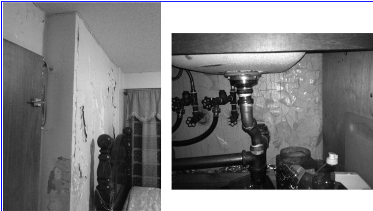
FIG. 2. Housing conditions prior to intervention.

conference was held and Requests for Accommodation were announced on behalf of six NYCHA tenants whose uncorrected conditions jeopardized their health. 20 In December 2013, the coalition had reached an agreement with NYCHA to settle the ADA claim. In April 2014, the United States District Court for the Southern District of New York approved the negotiated class action settlement in Baez v. New York City Housing Authority (No. 13 CIV 8916). 21